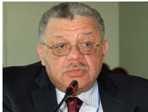
Philadelphia Commissioner and PERF President Charles Ramsey

This becomes more and more of a challenge as we get new types of "less lethal" technology available to us. Sometimes our policies on new technology