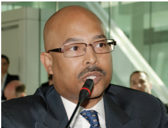
Detroit Chief Ralph Godbee

The early warning system you develop in your