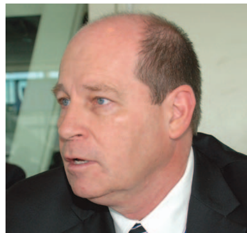
Winston-Salem, NC Chief Scott Cunningham

In the early 1990s, we increased our training on effective communication skills and open-hand tactics. Unfortunately, when officers started putting their hands on people more often, we saw some deaths due to positional asphyxia. So we then integrated ways to avoid positional asphyxia into the training. But overall, we improved our training on the lower end of the use-of-force continuum, and it resulted in fewer use-of-force problems.