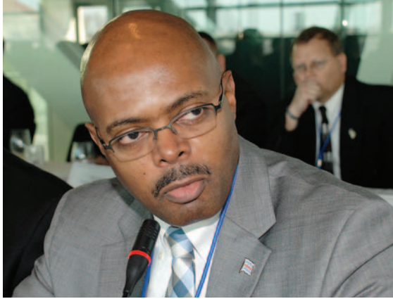
Chicago First Deputy Superintendent Al Wysinger

more quickly and safely than if there were only one or two officers responding. And we have an ambulance on hand for any medical treatment that is needed immediately.